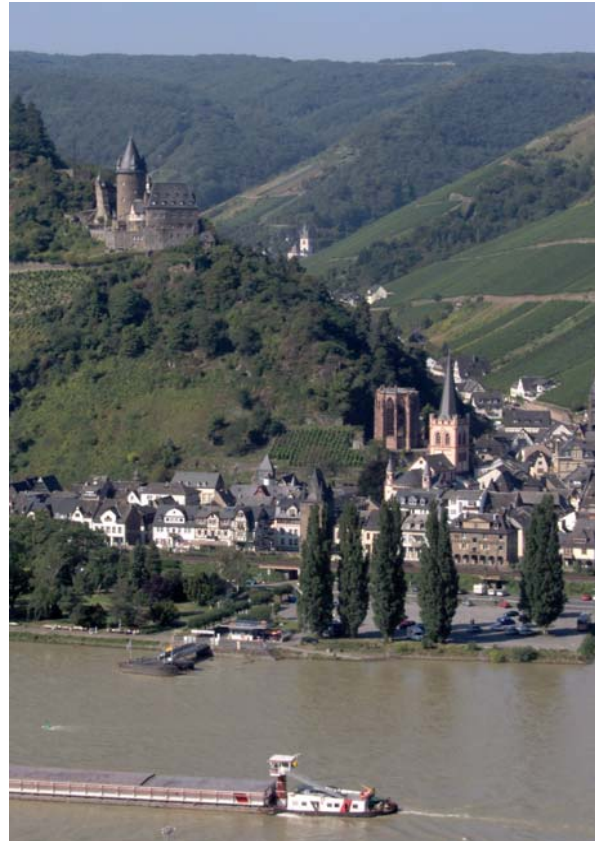
View of Bacharach from the other side of the Rhine