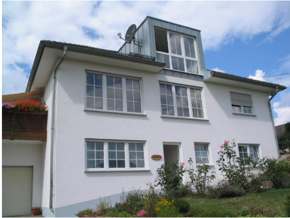
House with entrance to the apartment