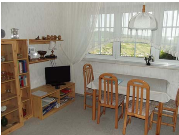
Partial view of the living room

Bed linen, towels, final cleaning, telephone, internet and electricity are included.